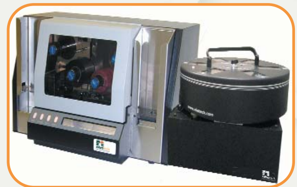
Optional 6-hopper carousel